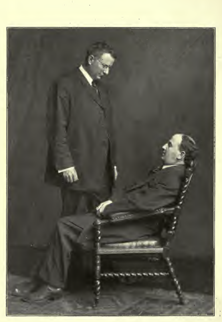
A CONDITION OF VOLUNTARY RECEPTIVITY (See page 74)